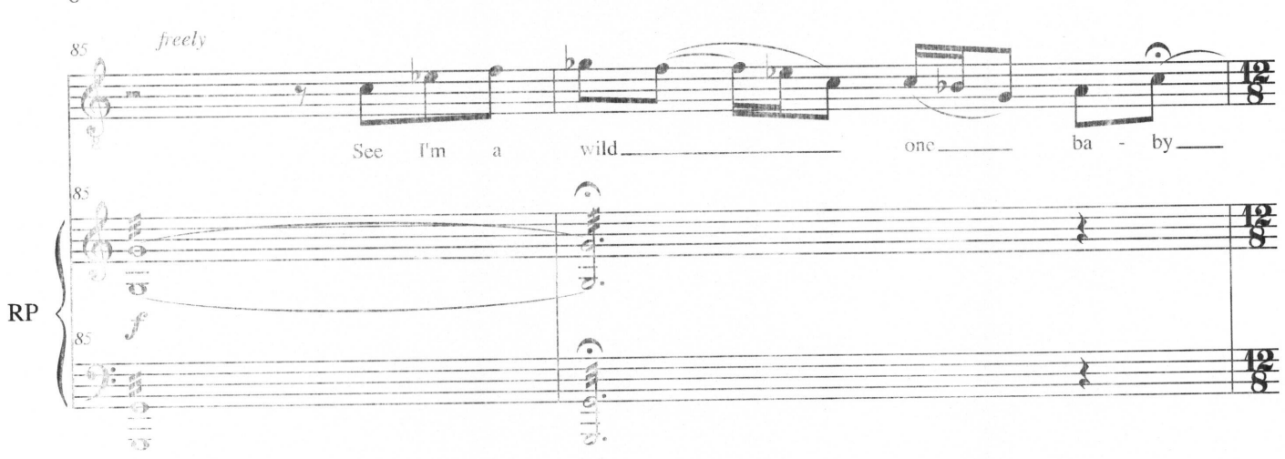
Slow Blues Shuffle Tempo (M.M. J. = c. 66)